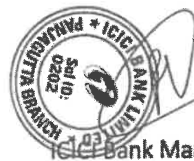
ICICI Bank Manager Punjagutta, Hyd Branch

This certificate is issued at the specific request of the customer and in accordance with, and subject to, the terms and conditions as applicable to the Savings Account. The bank disclaims any liability for any credit related decision taken by any user based on the certificate.